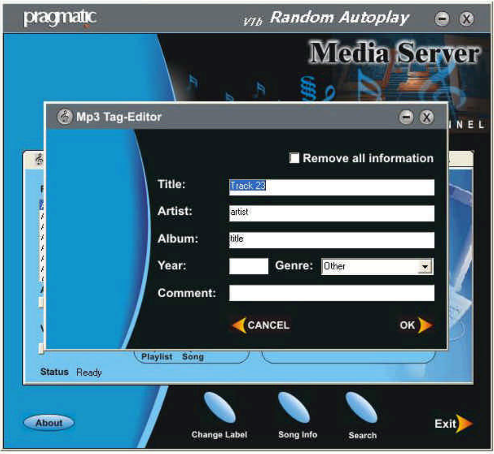
FIGURE 8: Song Information