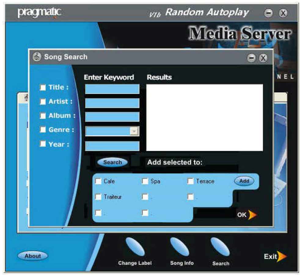
FIGURE 9: Search and Share Songs among rooms