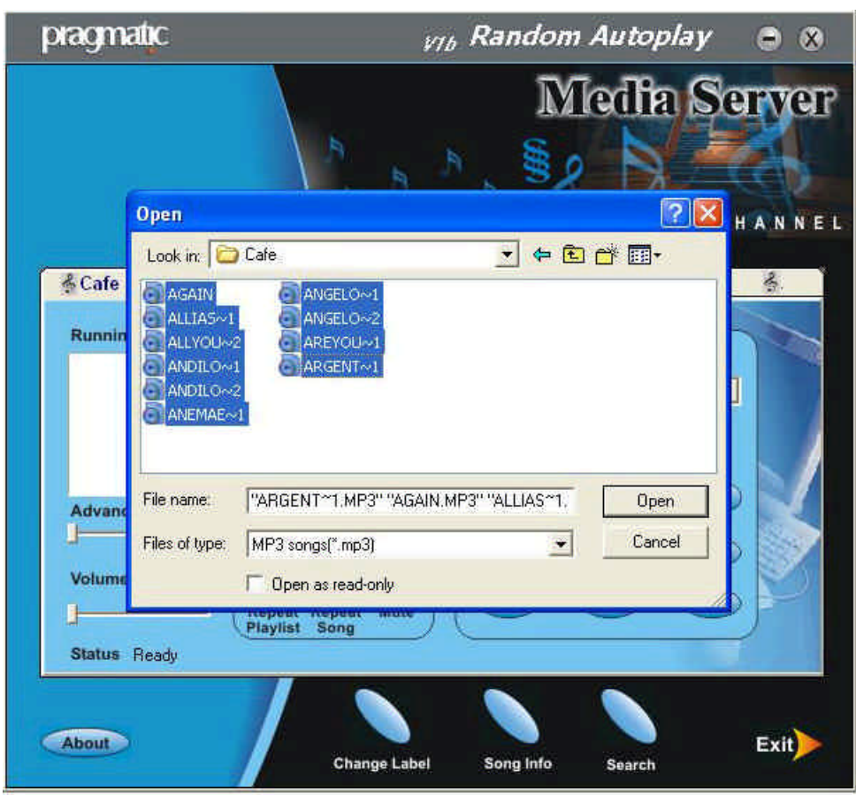
FIGURE 2: Select songs for play list

Click on tab Café as shown in figure1, to activate room one, then click on button with '+' symbol, to add song(s) to play list. Another window opens up, browse desktop to locate folder named Café, select desired number of songs in that folder as shown in figure2 then click on button 'open'. The selected songs are loaded in the 'running play list' section of the Media Server window as displayed in figure 3.