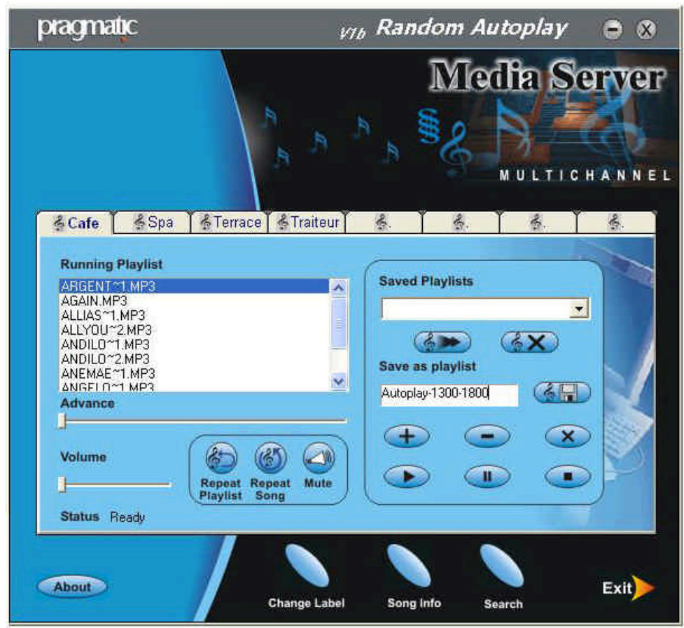
FIGURE 3: Name and load play list

Where HHMM represents starting two digit hours and starting two digit minutes and hhmm designate ending two digit hours and ending two digit minutes. The time difference between starting and ending periods can be as little as 1 minute or as large as up to 23 hours and 59 minutes. Any number of play lists can be created. To save the play list click on the button with floppy image on it.